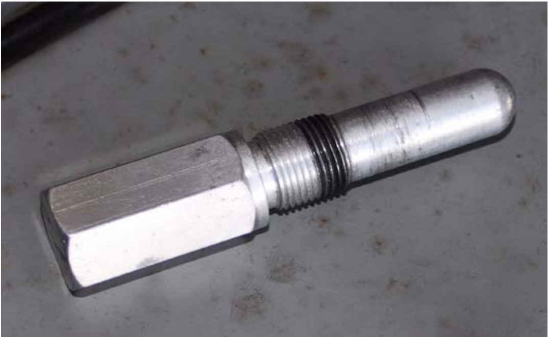
Figure 1 Stop Pin